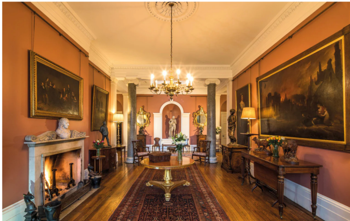
The entrance hall at Wormington Grange