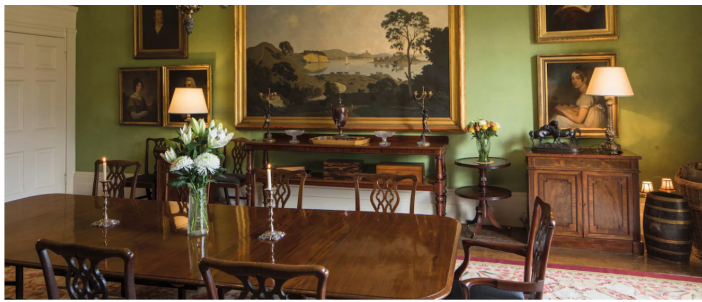
The dining room, with Algernon Newton's painting A Dorset Landscape

The auction will take place at 10.30am on Wednesday 12th, Thursday 13th and Friday 14th May at Duke's, Brewery Square, Dorchester. To view the catalogue, visit dukes-auctions.com .